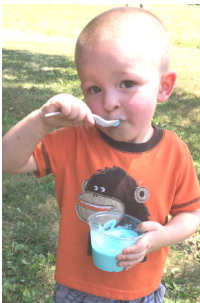
Lots of Good Food!